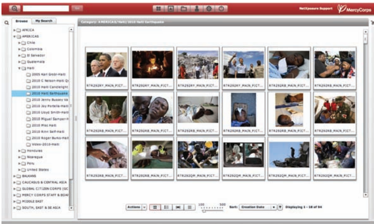
Display CMS Client

Image slideshows and video presentations stored in the DAM are programmed to be remotely distributed to external kiosks or monitors.