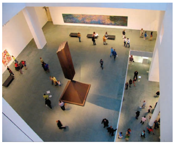
NetXposure's Digital Asset Management solution is used to manage digital images, documents, video and data associated with the world's finest collection of modern and contemporary art.

Included in NetXposure's Developer Tool Kit module is a full Web Services API, so you can essentially remote-control the application from any external system. The API itself is built on Apache's Axis Web Service framework, meaning that it is entirely standards-compliant and interoperates with Java and .NET. The Web Services API provides SOAP-RPC over HTTP access to NetXposure, and includes documentation, sample code, and Java-wrapper code.